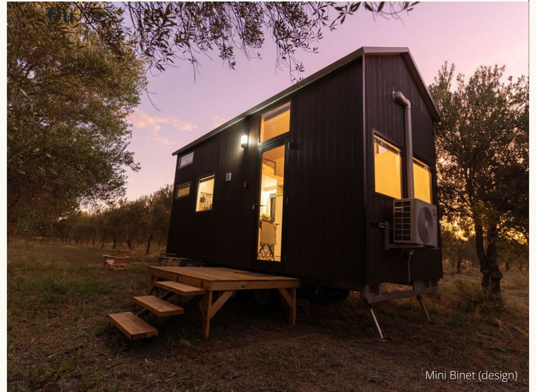
Mini Binet (design)

There's an abundance of local accommodation ranging from hotels, resorts, Airbnbs and luxury farms all within minutes of Domaine de Binet. We'll happily provide you with a list of recommended accommodations for you and your guests.